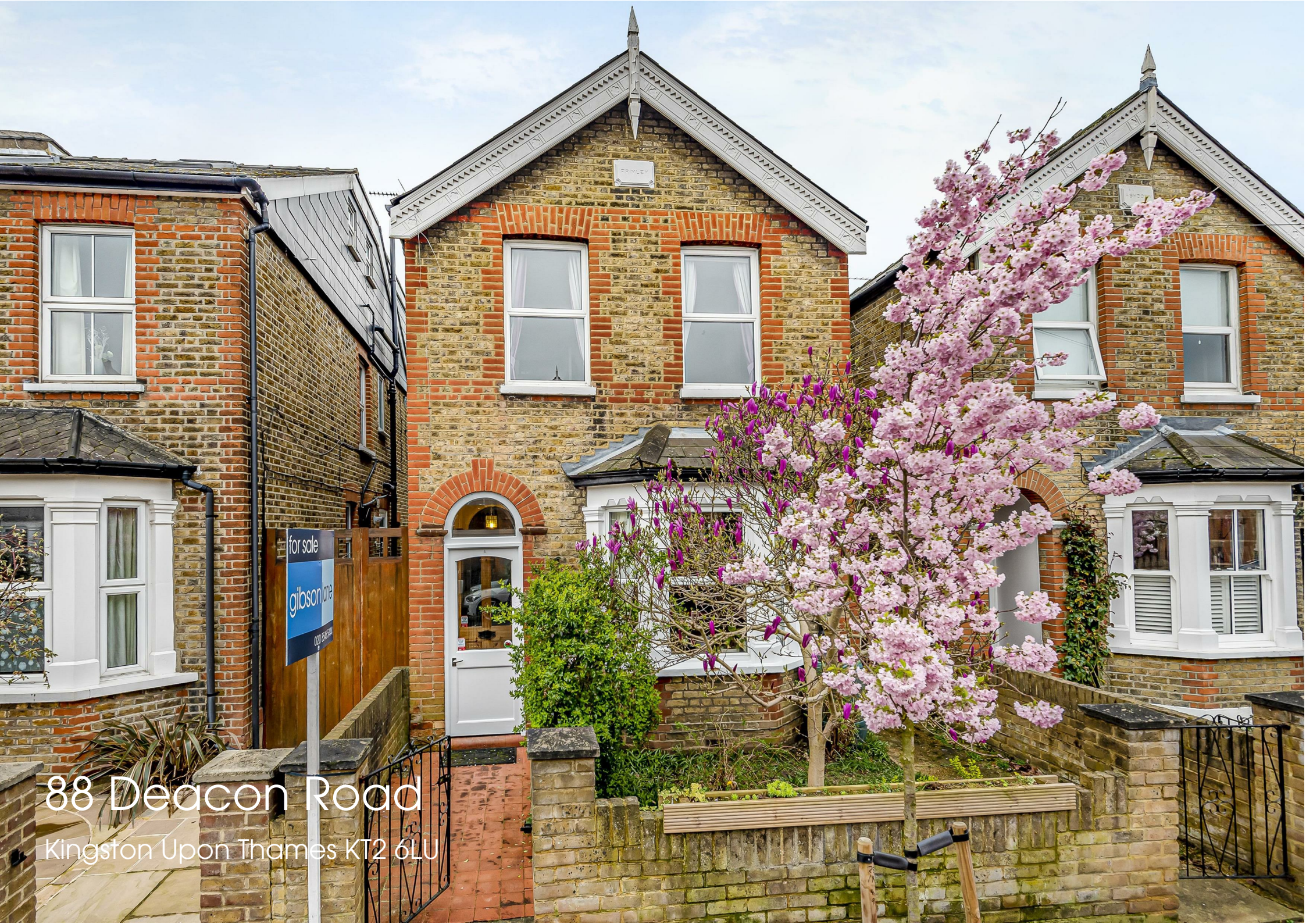
88 Deacon Road Kingston Upon Thames KT2 6LU

34 Richmond Road Kingston upon Thames Surrey KT2 5ED www.gibsonlane.co.uk Tel: 020 8546 5444