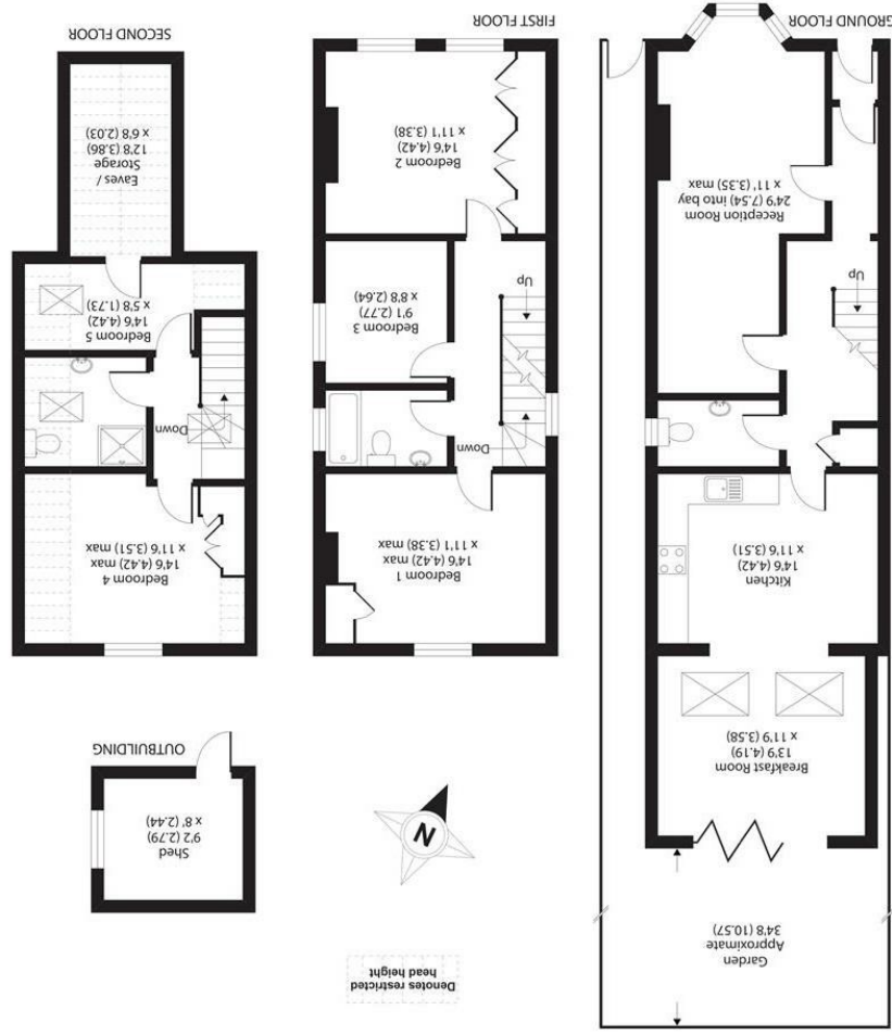
APPROX. GROSS INTERNAL FLOOR AREA 1585 SQ FT / 147.3 SQ METRES (EXCLUDES RESTRICTED HEAD HEIGHT & OUTBUILDING)

34 Richmond Road Kingston upon Thames Surrey KT2 5ED www.gibsonlane.co.uk Tel: 020 8546 5444